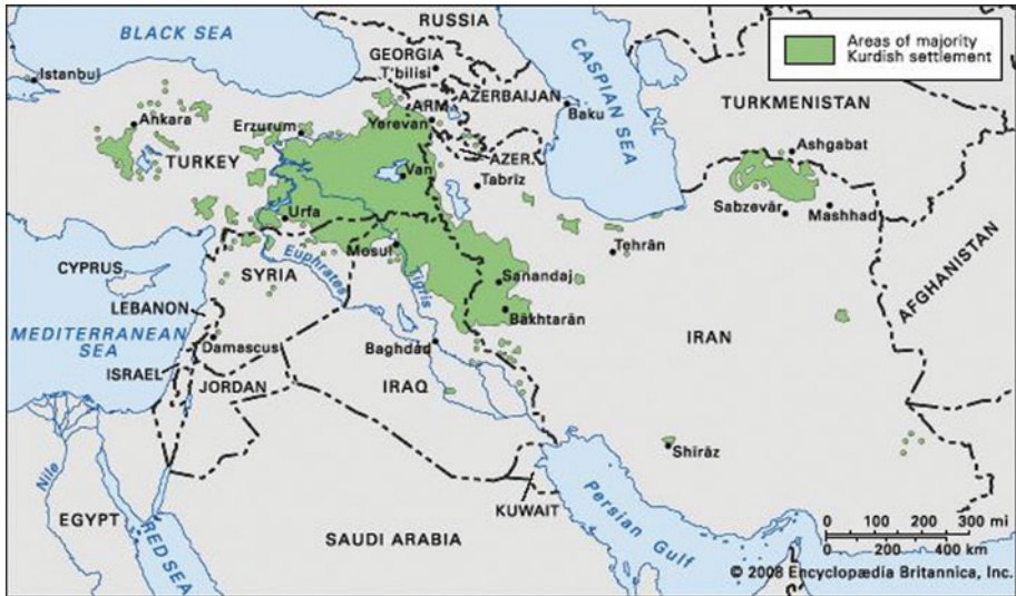
Figure 1. Distribution of Kurds in the Middle East, 2012